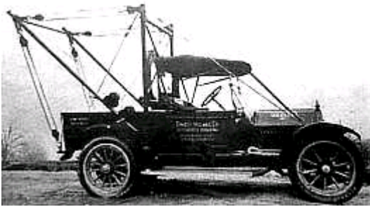
1913 Cadillac Tow Truck

type vehicles that were built on Cadillac chassis: