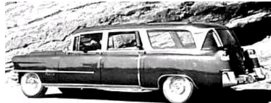
1955 Cadillac 12 Passenger Skyview Limousine

Most of us are familiar with Cadillac hearses and limousines that were used as funeral cars. Cadillac developed a very strong presence in this niche market because its smooth V-8 and heavy-duty frame combined with automobile-based riding qualities, made these cars well suited for applications where comfort and reliability were as important as heavy load capacity. The custom hearse and ambulance bodies by builders such as Hess & Eisenhart, Miller-Meteor and Superior, to some extent resembled the suburban carry-all made by Chevrolet.