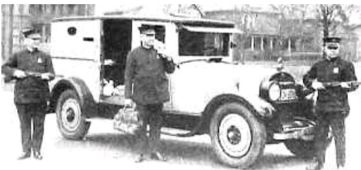
1924 Cadillac Armored Car