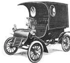
1904 Cadillac Model A Delivery Wagon

The answer is yes, no, and maybe. According to the Cadillac Database, (see, www.car-nection.com/yann/ ). Cadillac trucks were first advertised around 1904 on the single cylinder chassis. These small vans were offered with either solid or canvas tops and were designed to take the place of horse-drawn delivery wagons. Because they were more reliable and cheaper to operate than horses, they held the same appeal to businessmen that the Cadillac car had to the motorist. They strongly resembled the automobiles they were based on.