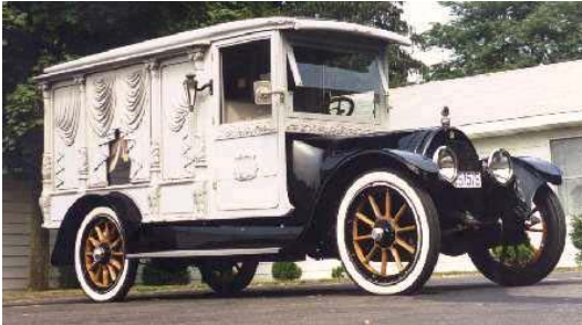
1916 Cadillac V-8 Hearse