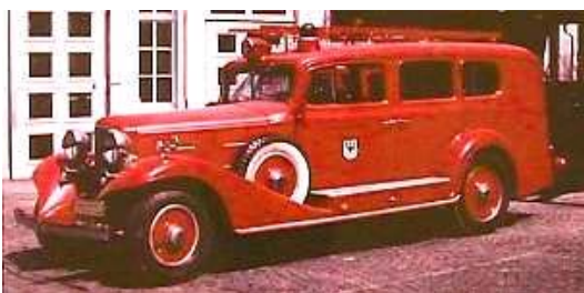
1933 Cadillac Fire Truck