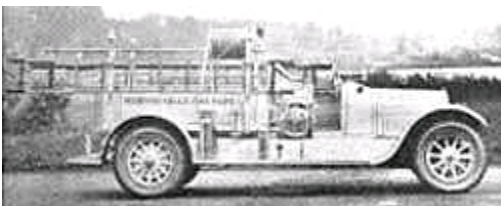
1920 Cadillac Fire Truck