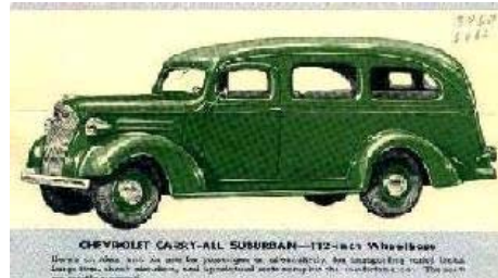
CHEVROLET CARRY-ALL SUBURBAN—112-inch Wheelbase

As I pondered that question, my thoughts again turned to contemporary SUV's, really latter day substitutes for the popular station wagons of the 1950's-1980's. The first SUVs were derived from light trucks with station wagon (or suburban) bodies. The original Chevy Suburban, a large wagon on a commercial chassis introduced in the mid 1930s as the "carry-all suburban," may be the "grand-daddy" of this type of vehicle.